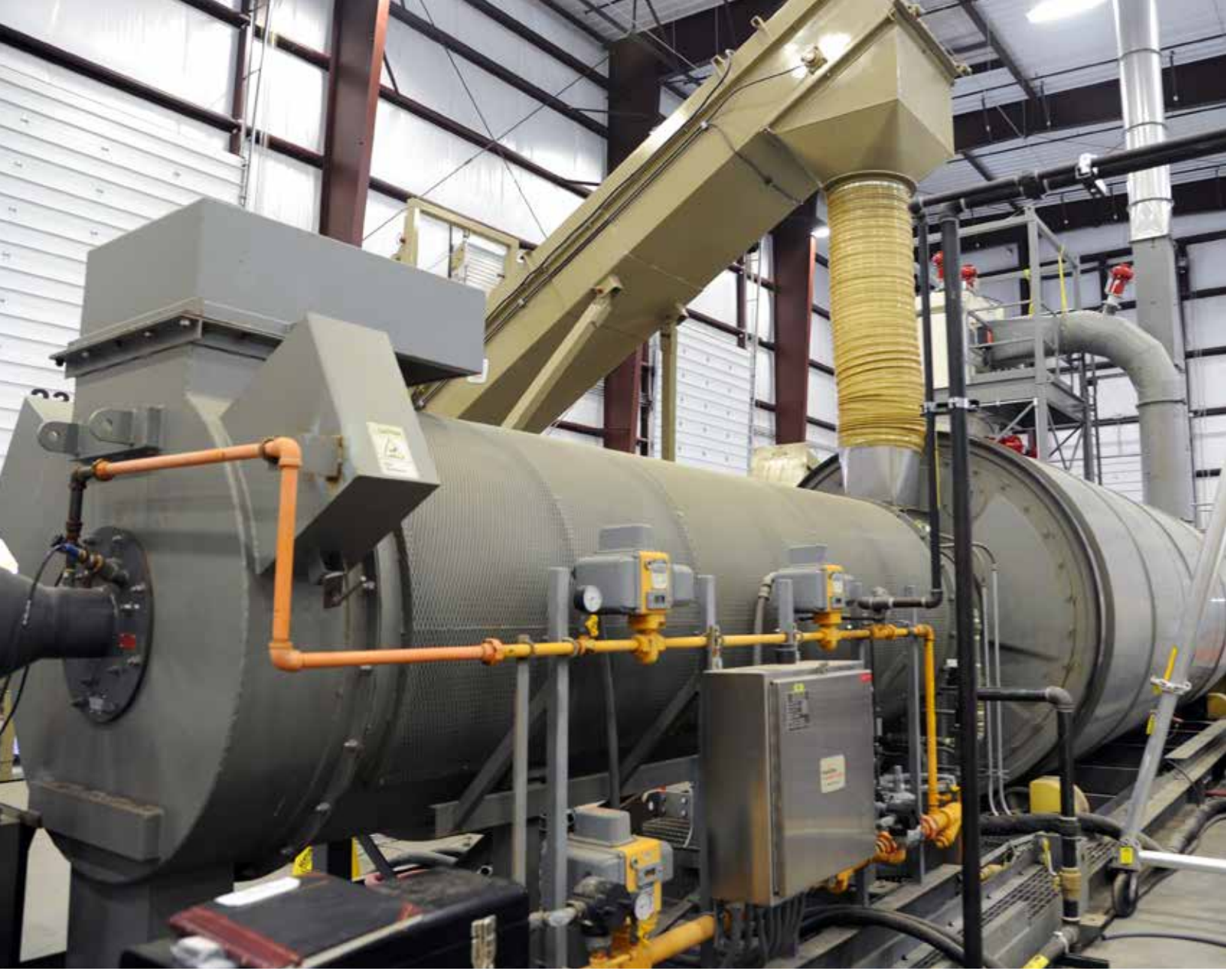
Figure D-1. PDU housed at INL.

from major sponsors; operate as scientific, technical, and specialized engineering resources; and have governing bodies that approve the experiments and recommend facility improvements.