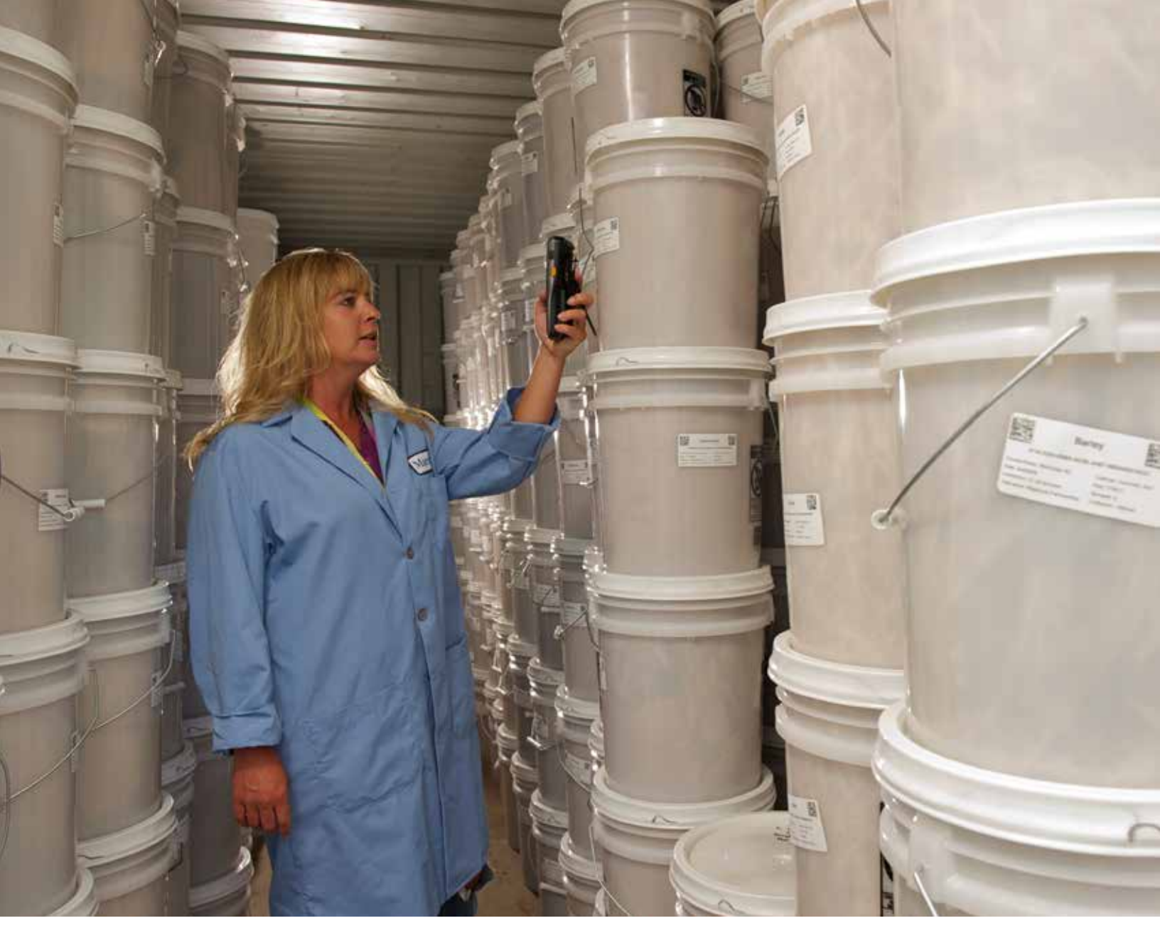
Figure D-2. Examples of labeled storage containers in the Bioenergy Feedstock Library.

parameters vary and are often project driven, typical parameters measured include feedstock moisture, ash, compositional (i.e., extractables, ash, lignin, glucan, and xylan), proximate/ultimate analysis (i.e., carbon, hydrogen, nitrogen, sulfur, oxygen, lower and higher heating value, and calorimetric data), elemental speciation, particle size, reactivity and density.